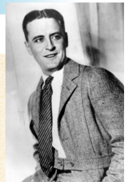
A 1920s photo of F. Scott Fitzgerald